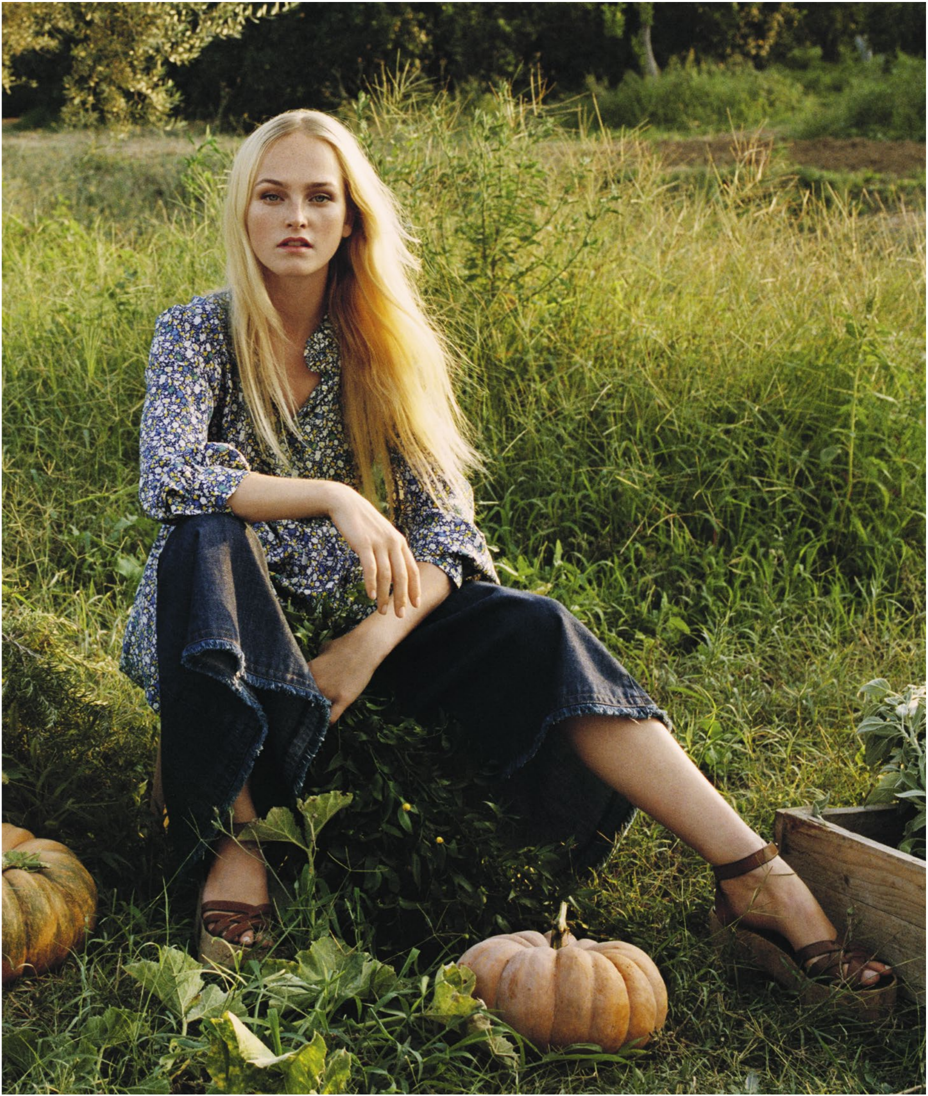
OPPOSITE PAGE: Shirt VOCIARE Trousers ROMEO Foulard PANAMA Shoes PAPY.