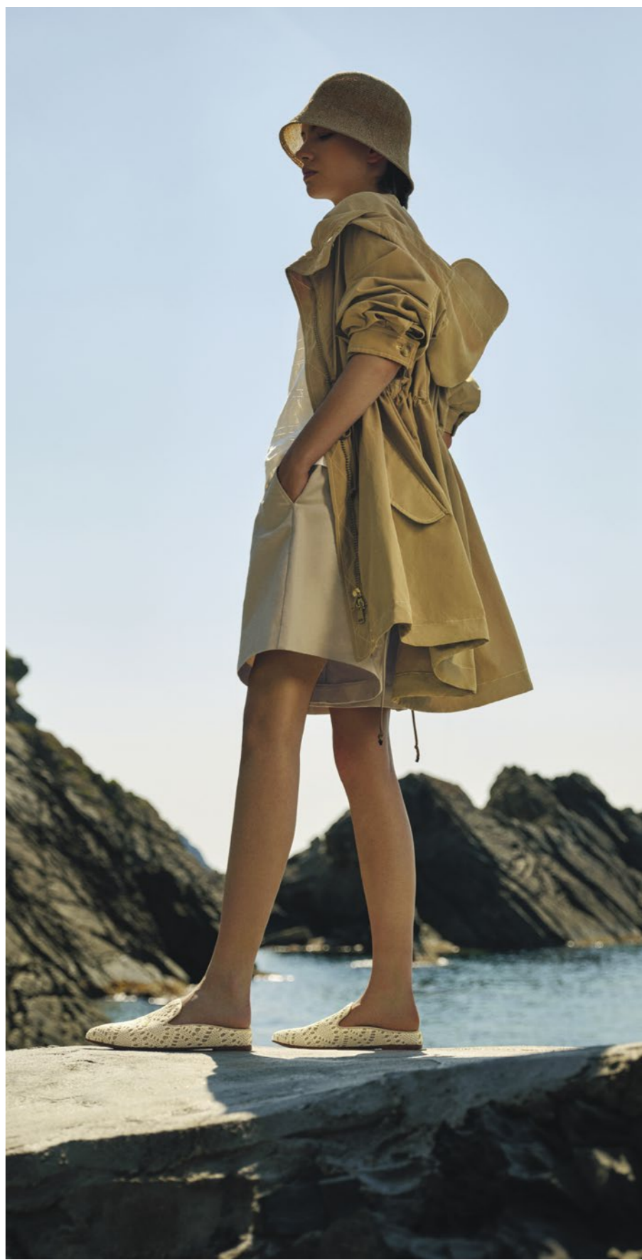
OPPOSITE PAGE: Jacket SERGIO T-shirt MULTIF Skirt GRADO Hat GIUBILO Pasticcino Bag BARD Shoes CIGNO . ON THIS PAGE CLOCKWISE: Bag ANNICA — Parka COCCOLE T-shirt GESSY Shorts VISINO Hat GIUBILO Shoes ORMA — Necklace TEHERAN .