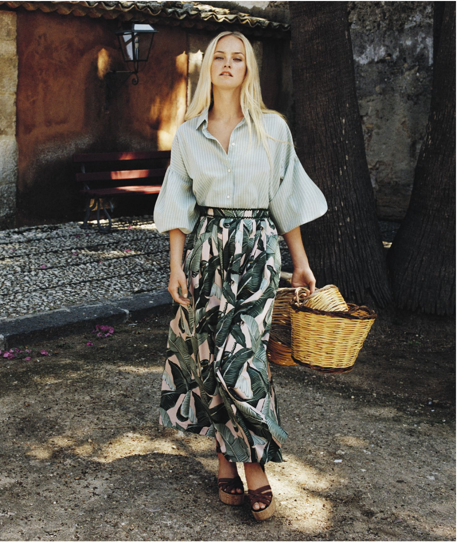
OPPOSITE PAGE: Dress RAGAZZA Trousers ROMEO Foulard ONESTO Bag COLLE Shoes PAPY. ABOVE: Shirt BALEARI Skirt EGUALE Shoes RITO.