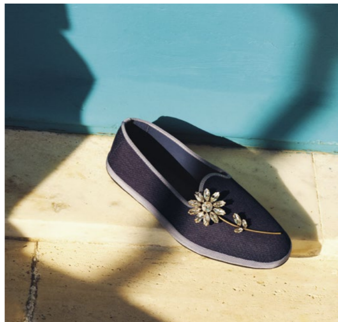
ON THIS PAGE CLOCKWISE: Dress PACOS Foulard GIOSTRA — Shirt MILVA Shorts VISINO Pasticcino Bag BARD Shoes PAPY — Shoes FOLIGNO Brooch BREAK — Dress SALA Skirt OBLARE Pasticcino Bag UGOLA Shoes ALGEBRA. OPPOSITE PAGE: Knitwear GHIACCI Dress RIVALTA Shoes ALGEBRA.